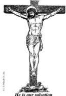
He is our salvation